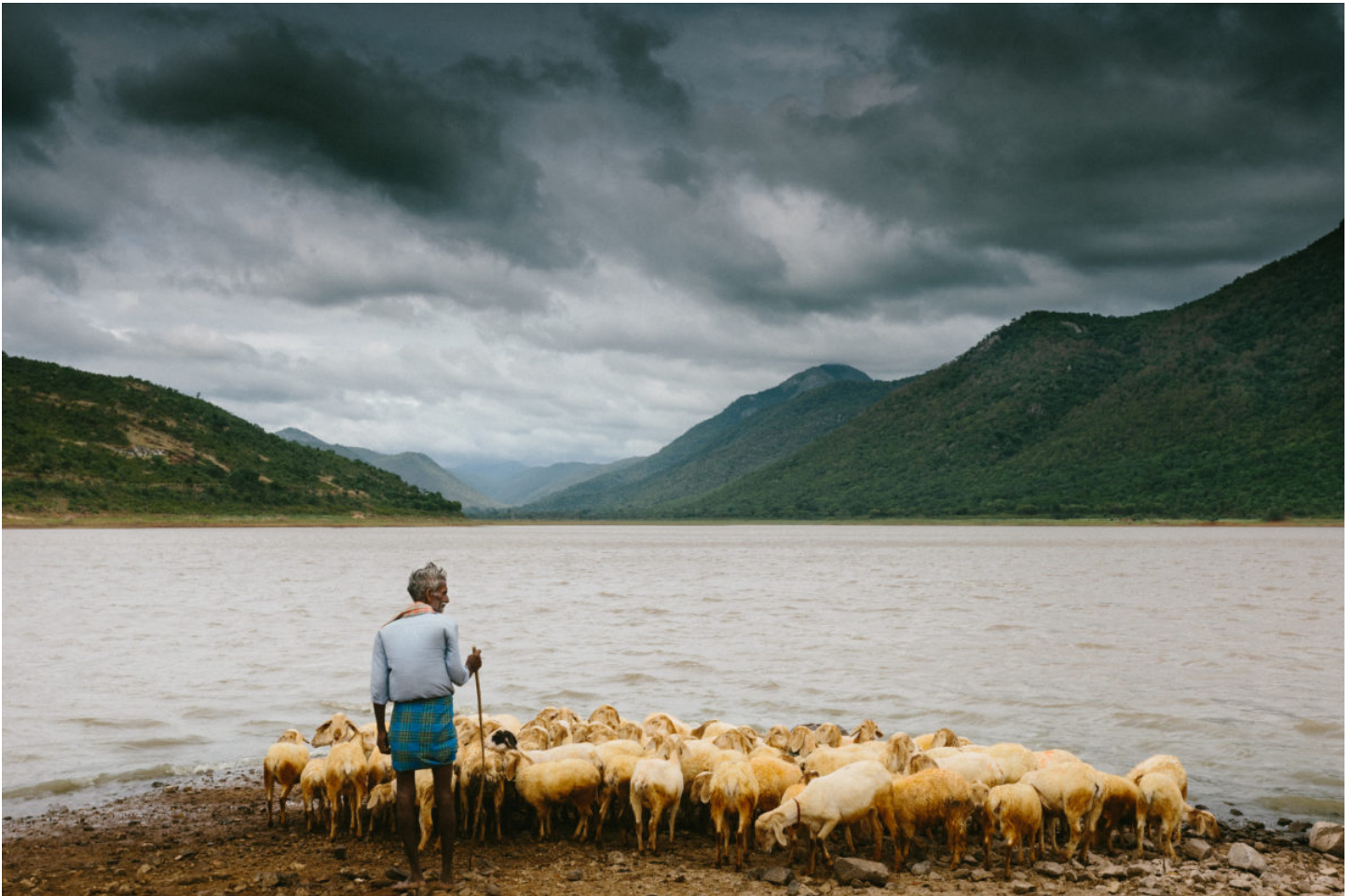
"The shepherd,"